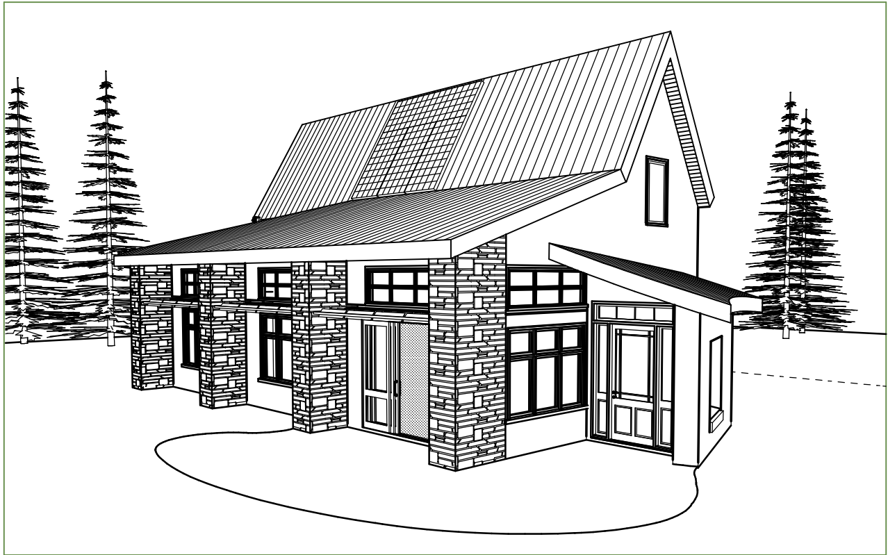
View to the entry from the Southeast.